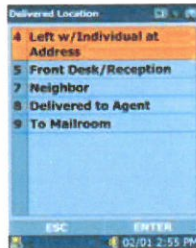
Select Delivery Location